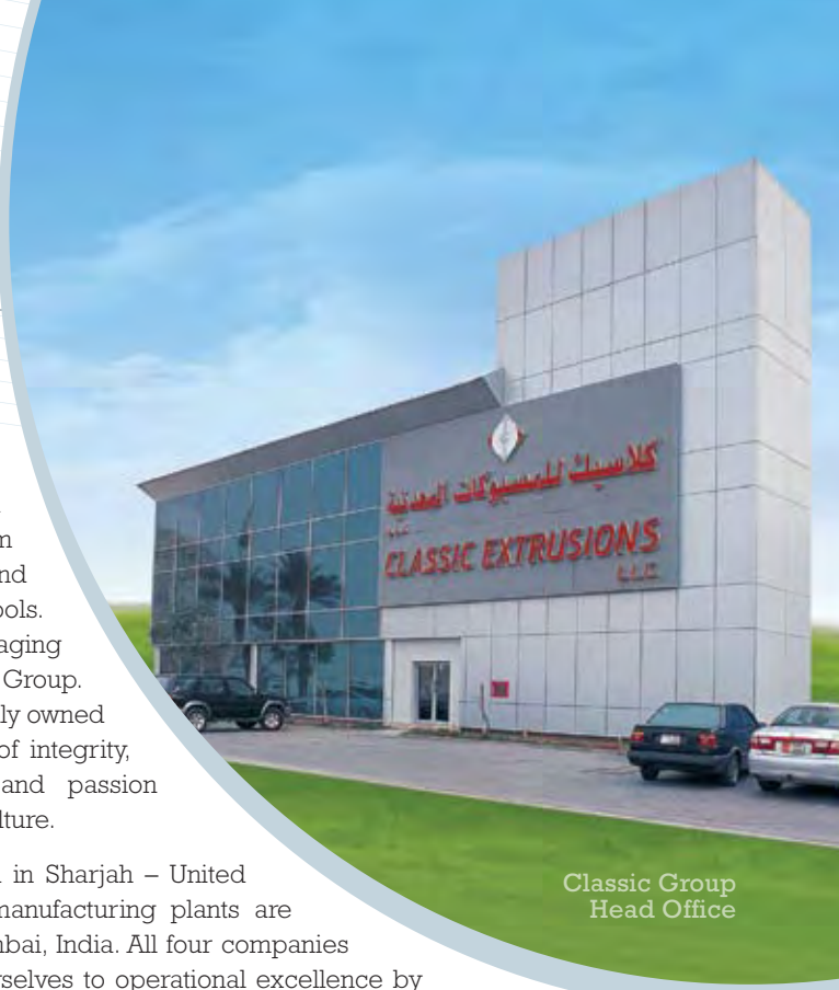
Classic Group Head Office

Our Group Head office is located in Sharjah – United Arab Emirates (U.A.E) and our manufacturing plants are situated in Sharjah, U.A.E and Mumbai, India. All four companies are ISO certified. We dedicate ourselves to operational excellence by pursuing continuous improvement in all of our operations. We are committed to work across our enterprise to deliver quality products and services that enable our customers to increase efficiency thus achieving a new level of progress.